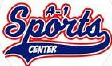
Donated Rally Towels & Table Covers