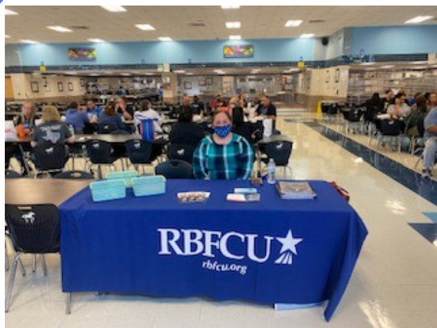
Donated Bill Miller BBQ Chop lunch with trimmings.